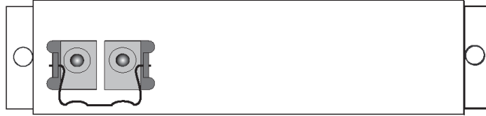
AC power in rear panel of NetOptics 10/100BaseT Tap