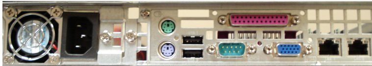
Rear of the chassis